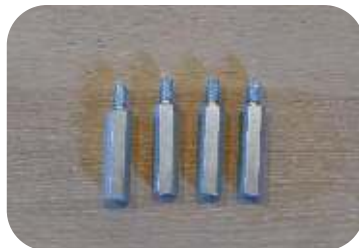
4 spacer bolts