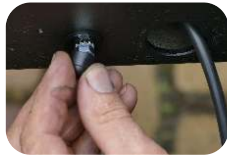
Place the M6 caps on the nuts.

TIP : you can also glue these on so they stay in place better.