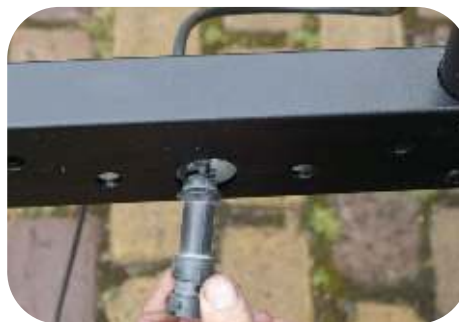
Insert the plug of the lamps through the largest hole (Dia. 30 mm) of the lower socket.