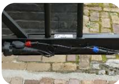
Attach the 13-pin plug to the plugs of the lamps. Red is right, blue is left.