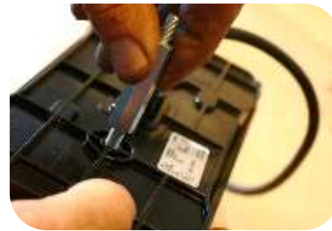
Tighten the spacer bolts onto these attached screws (2 per lamp)