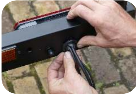
Replace the lighting