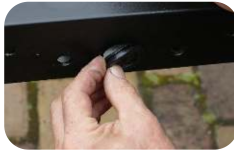
Remove these tulles from the tube