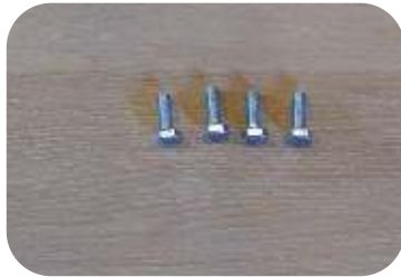
4 hexagon screws M6