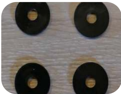
4 black plastic washers

Please note that the arrows, indicated on the back of the lamp, point outwards.