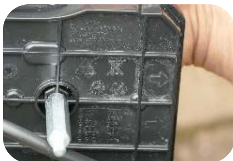
Insert both lamps, fitted with the spacer bolts, through the holes provided in the lower tube.