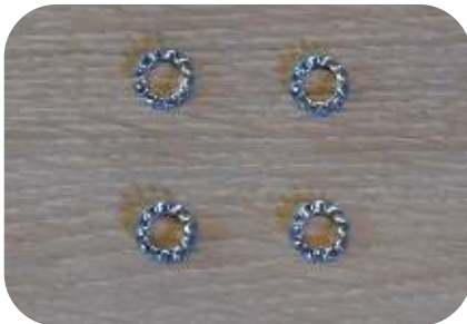
4 serrated washers M6

Place the black plastic washers (2 per lamp) over the threads of the spacer bolts.