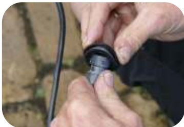
Plug the plug of bulbs through the grommet and replace the grommet.

TIP : you can also glue these on so they stay in place better.