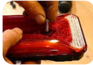
Insert the screws through the hole of the lamp (2 per lamp)