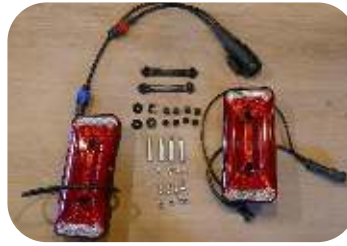
Parts overview of the JOKON LED lighting set