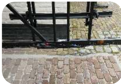
Secure all wiring with the supplied cable clamps to the rear of the lower horizontal tube.