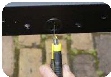
Make a cross with a knife in the 2 passages of the lower horizontal tube.