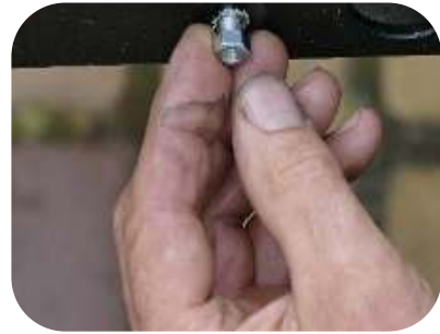
Screw the whole with the nuts M6 (4 pieces) max. 1 Newton.