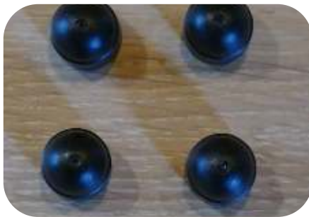
4 cover caps M6